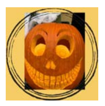
We had several community partners participate in the festivities