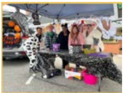
Trunk or Treat was a great success this year!